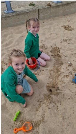
Year 1 and Year 2 had fun at the beach

The fact that the cost of a holiday increases significantly is not a valid reason for absence unfortunately, and is one that we know all too well working in a school.