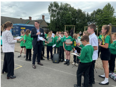
The children enjoyed meeting staff from Banks Homes.

We are watching the development of the new Banks housing estate change and grow week by week right next door to school.