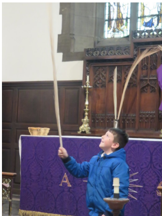
Pupils enjoy learning even more about Palm Sunday and how it is celebrated.