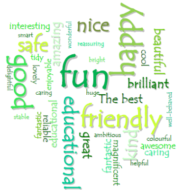
Word cloud of our pupils' descriptions of our happy and fun school.

For a full analysis of both pupil and parent surveys please access our school website.