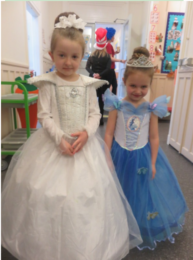
Above: Many princesses joined in the World Book Day fun!