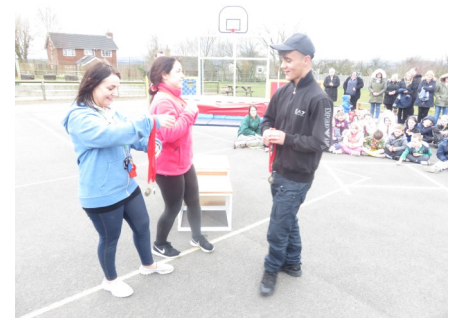
Some of our adult winners on Sport Relief day.

total raised by the charity on the night. Thank you so much for your generous support.