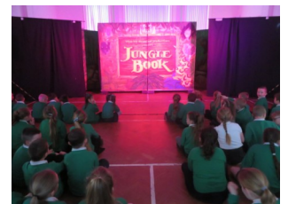
The Jungle Book by M&M Productions

Reception pupil watching 'The Jungle Book' in school.