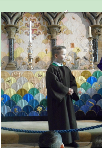
Pupils take part in the re-enactment of the life of Durham's most famous Saint

As part of a history unit all about Durham Cathedral and its importance, Year 2 visited our most famous local landmark to enrich their learning about Northern Saints.