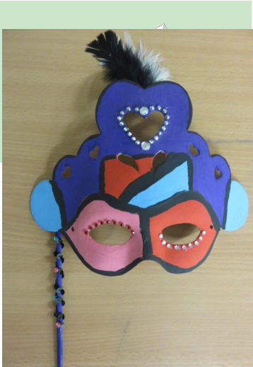
Romeo and Juliet inspired Y6 artwork this term.