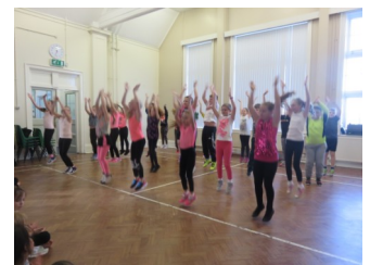
Above: pupils in class 5 performing to 'shut up and dance with me'