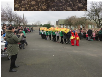
We braved the wind and drizzle to celebrate Chinese New Year with our families.