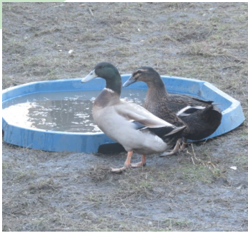
Our new friends, Donald and Daisy, help Reception to understand the tale of 'The Ugly Duckling'.

Our youngest pupils thoroughly enjoyed a fabulous experience this month when they visited Durham's Gala Theatre to see The Northern Ballet's production of 'The Tortoise and the Hare'.