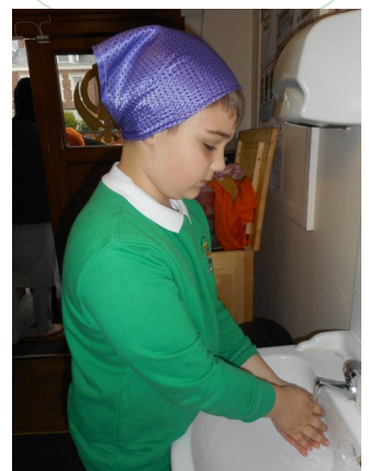
The children learned so much about the Sikh faith from their visit to the Gurdwara.