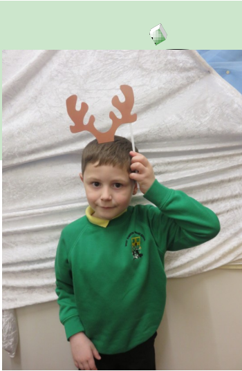
Our festive photos that filled our wreath

Another beautiful carol service took place in St Mary's Church this week and for many residents in the village, this is seen as the start of Christmas.