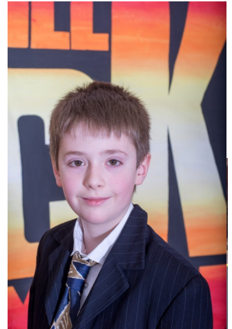
Key Stage Two's production of 'Schools Will Rock You' 2015

"Don't stop me now. I'm having such a good time, I'm having a ball.."