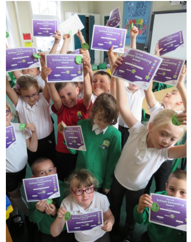
Children in Class 4 are the first pupils to achieve the ASA's school swimming award level one.